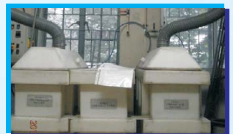
Zn Phosphate Coating