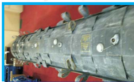
Float Assy Overhaul Chetak Helicopter