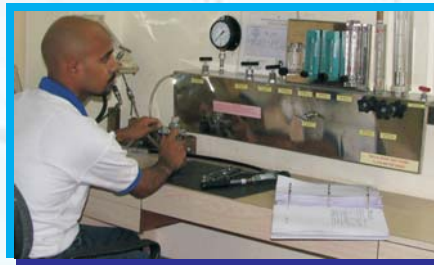
Regulator Overhaul & Testing