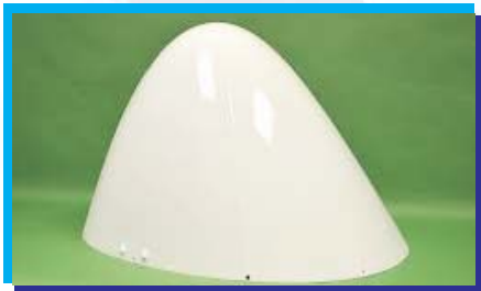
Indigenisation of Radome