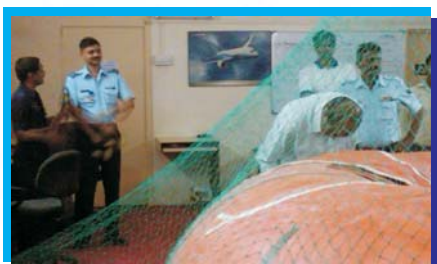
Float Assy Overhaul MI-17 Helicopter