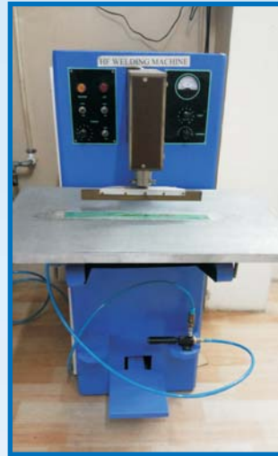
HF Welding Machine