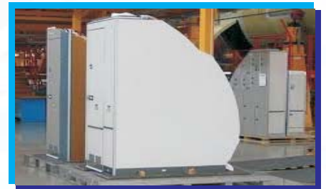
Indigenisation of Airborne Toilet Assembly