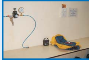
Life Vest Station