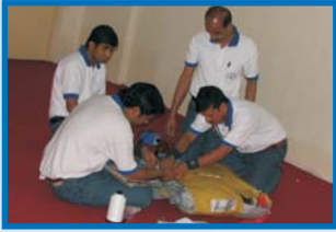
B-737 Escape Slide Final Packing