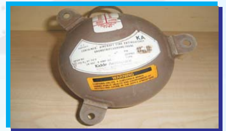
Fire Extinguisher HST & Refilling