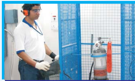
N2, CO2, Helium Charging Station