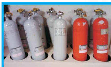
Flotation Gear Cylinders