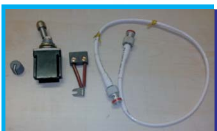
Indigenisation of Aircraft Spares