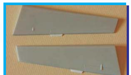
Indigenisation of Aileron Tabs