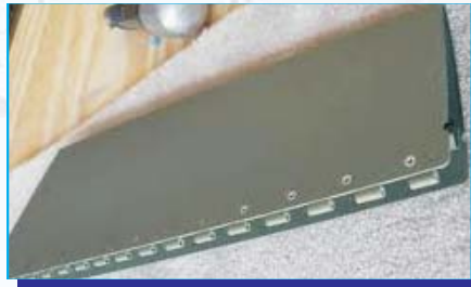
Indigenisation of Flight Controls