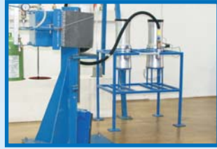
Aspirator Testing Fixtures