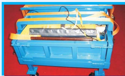
Airbus Slide Raft Packing Fixtures