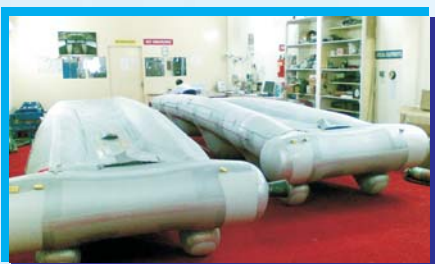
Escape Slide Overhaul